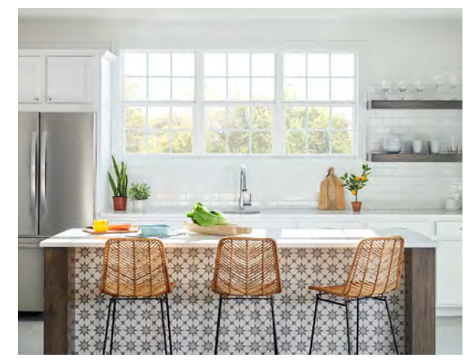
White Encompass by Pella single-hung windows with traditional grilles-betweenthe-glass.