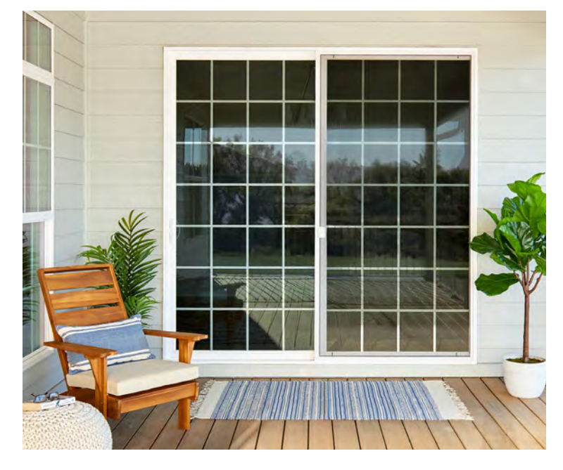
White Encompass by Pella sliding patio door with traditional grilles-between-the-glass.