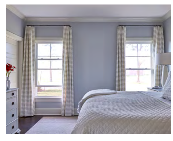
White Encompass by Pella doublehung windows with traditional grilles-between-the-glass.