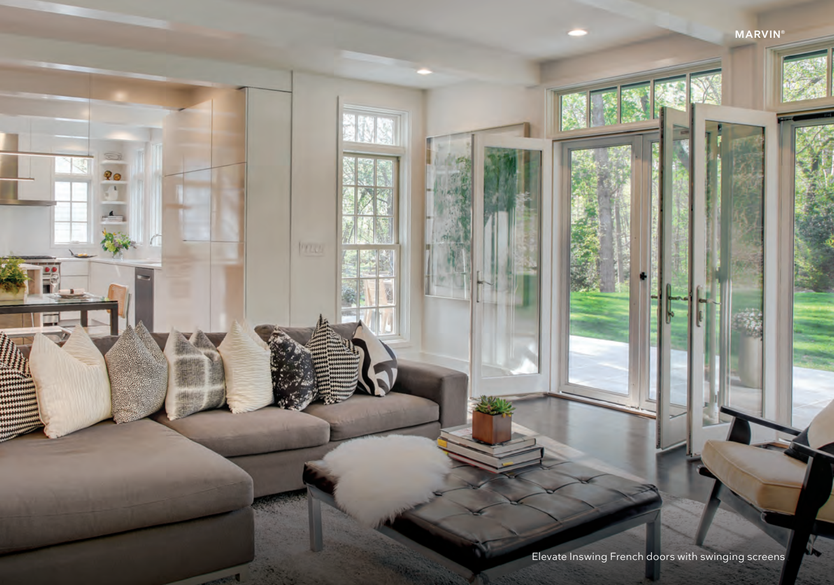
Elevate Inswing French doors with swinging screens