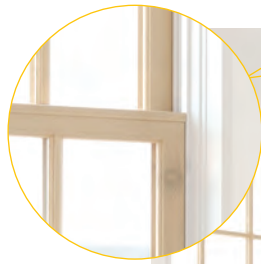
Clear Coat sash