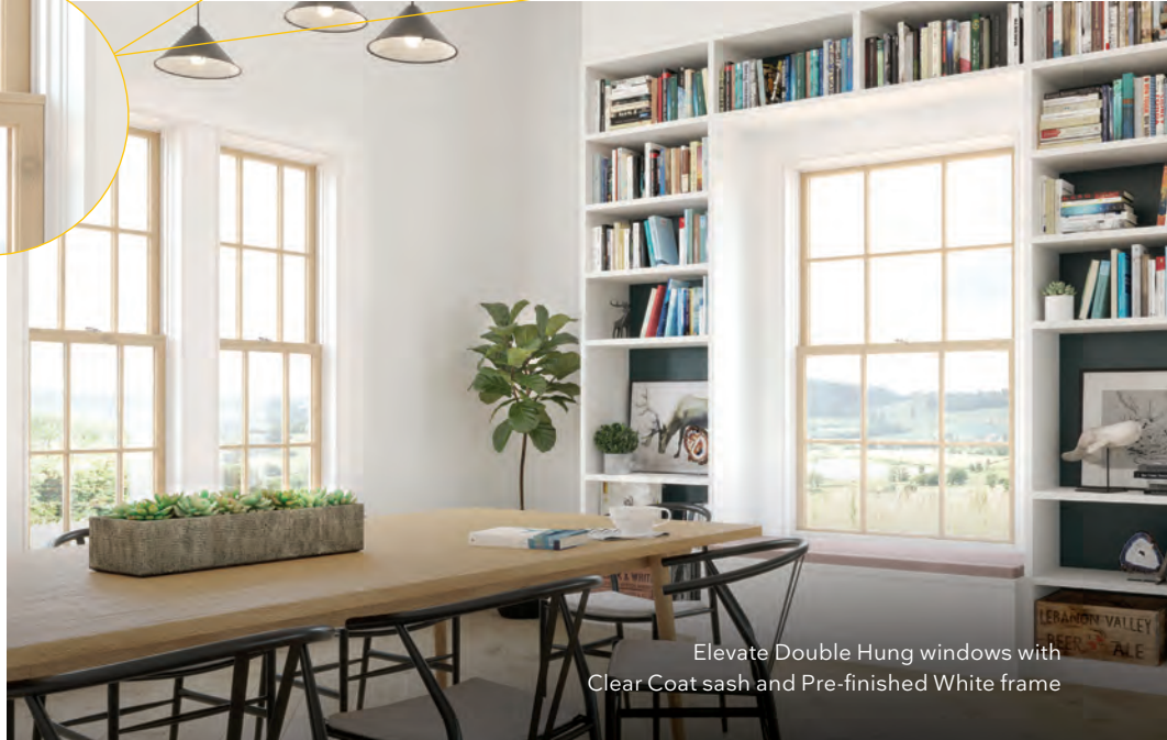
Elevate Double Hung windows with Clear Coat sash and Pre-finished White frame