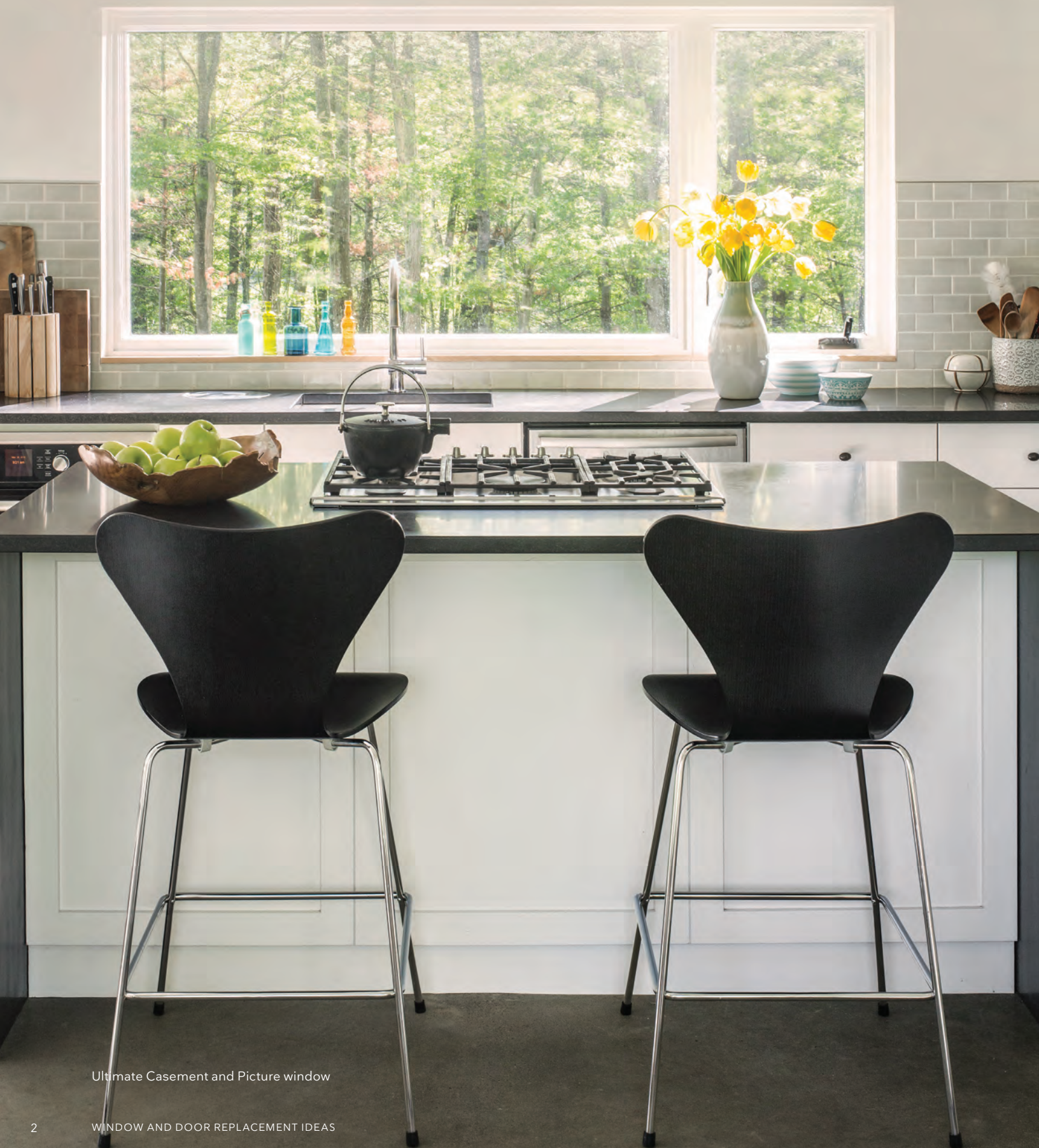
Ultimate Casement and Picture window