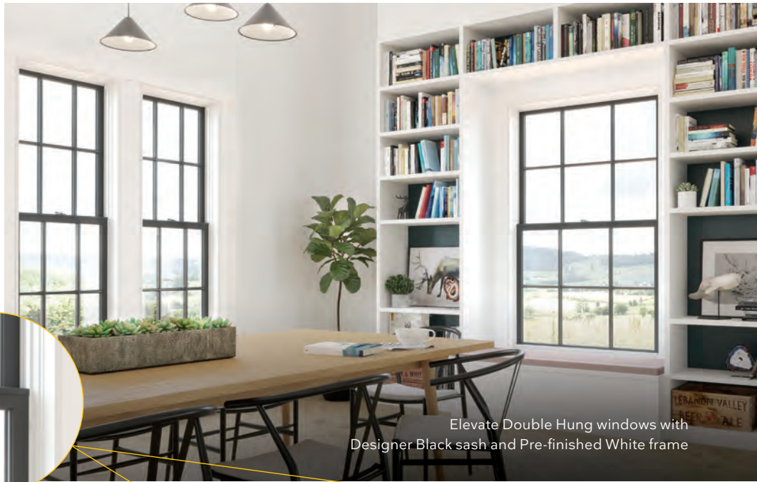
Elevate Double Hung windows with Designer Black sash and Pre-finished White frame