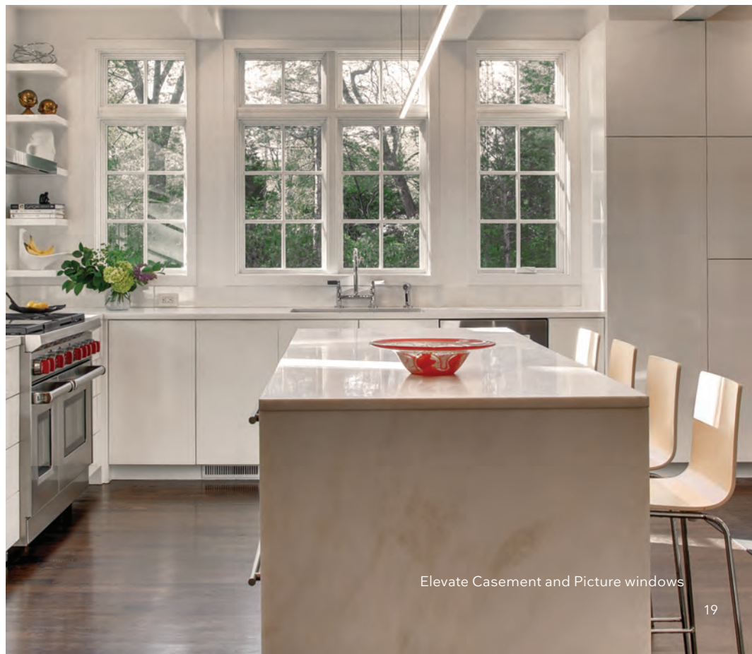
Elevate Casement and Picture windows

Choosing a white interior color for your windows helps accentuate the natural light from outside.