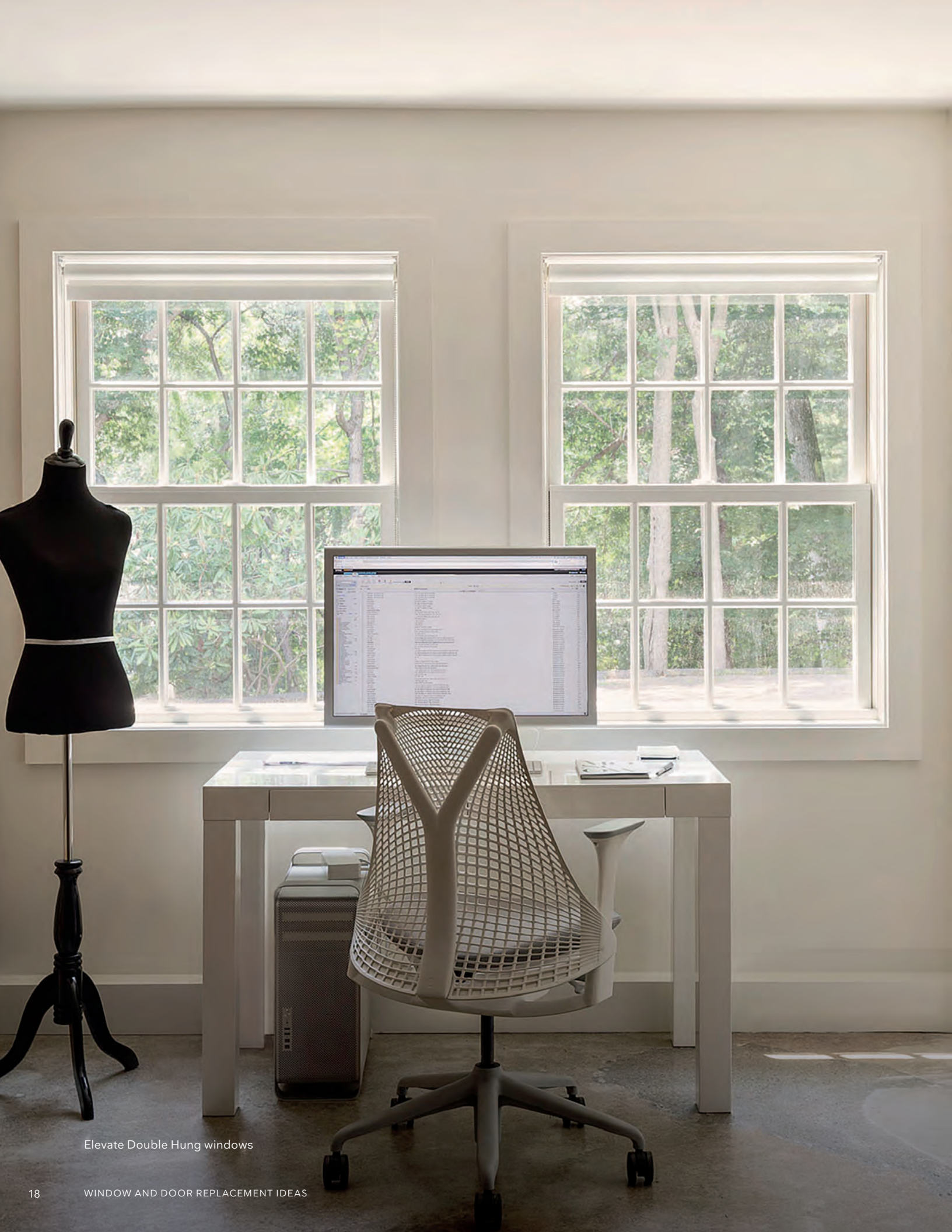
Elevate Double Hung windows