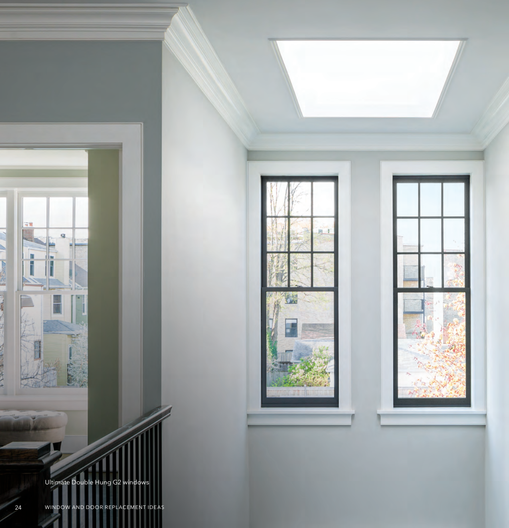
Ultimate Double Hung G2 windows