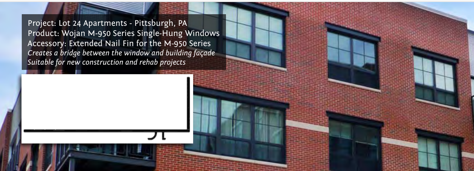
Project: Lot 24 Apartments - Pittsburgh, PA Product: Wojan M-950 Series Single-Hung Windows Accessory: Extended Nail Fin for the M-950 Series Creates a bridge between the window and building façade Suitable for new construction and rehab projects

Other New M-950 Series Accessories and Options Putty Glazing Options: Surface applied prior to glazing. Ideal for historical applications 1 1/4" IGU with louvers 2" IGU as triple glazed with a 1/2" airspace or with insulated panels to improve STC ratings Mull to our 2500/2600/2800 Series of sliding glass doors Truly Divided Lites on either the fixed or operable sash of the Single-Hung