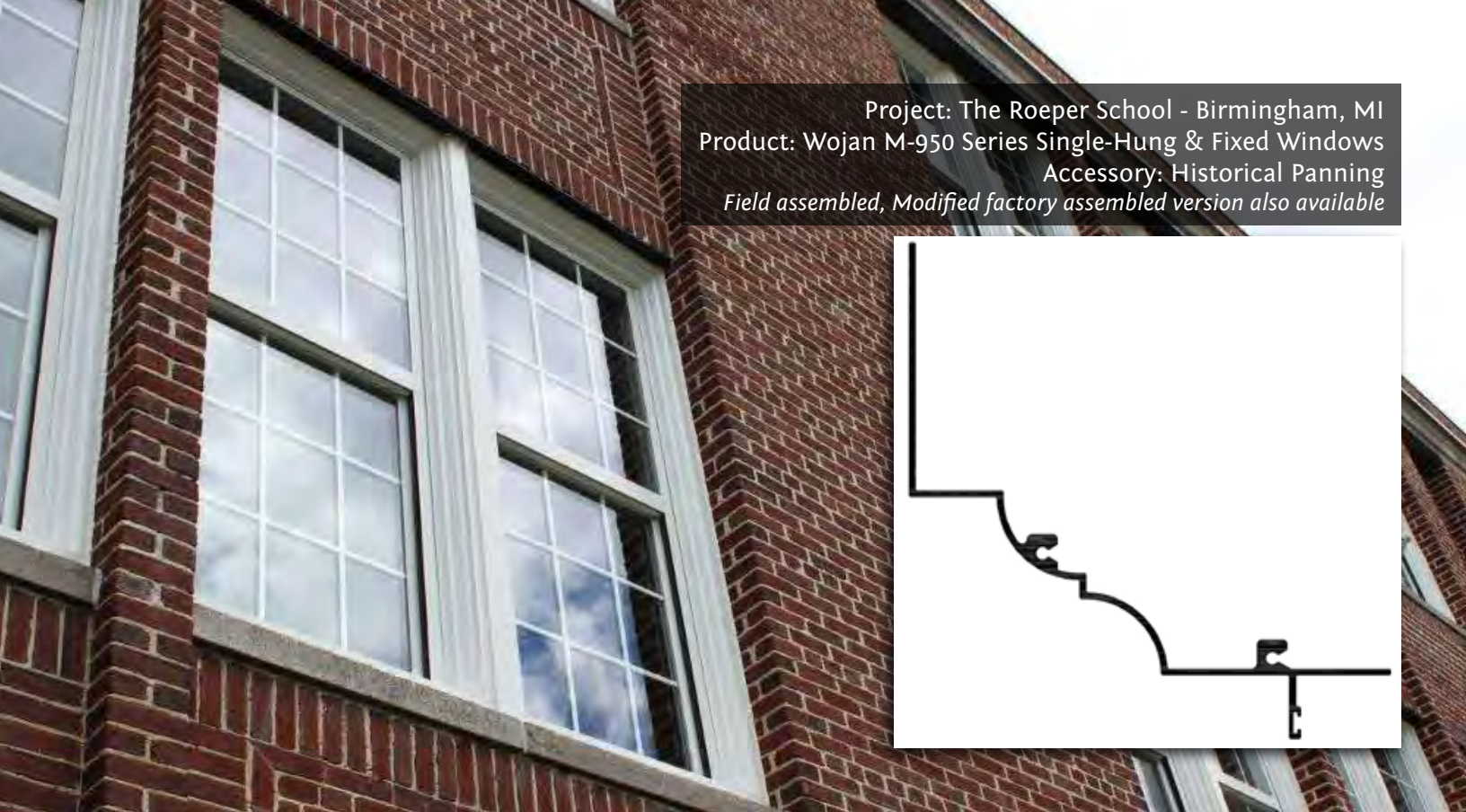
Project: The Roeper School - Birmingham, MI Product: Wojan M-950 Series Single-Hung & Fixed Windows Accessory: Historical Panning Field assembled, Modified factory assembled version also available