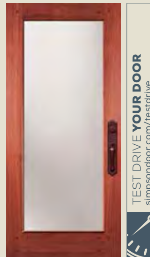
77002 Shown in sapele mahogany