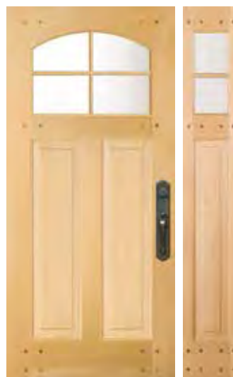
77684 RP Shown in nootka cypress with 77663 sidelight