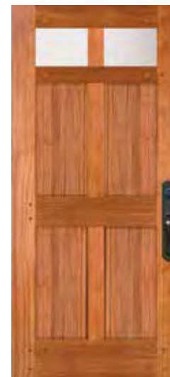
77132 FP Shown in sapele mahogany with optional shaker sticking