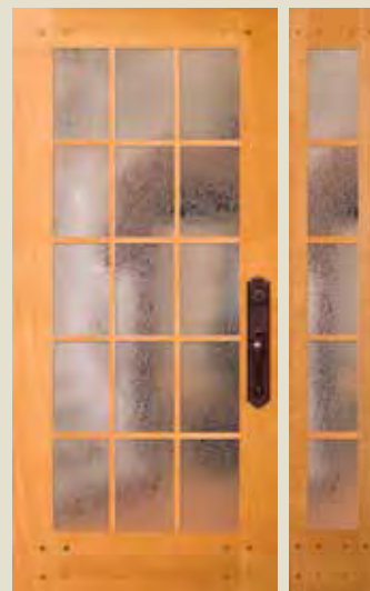
77015 Shown in Douglas fir with 77705 sidelight and optional shaker sticking and glue chip glass. Privacy Rating 6.