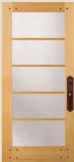
77105 Shown in nootka cypress with optional shaker sticking