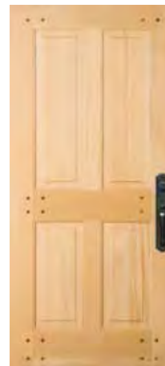
77144 RP Shown in nootka cypress