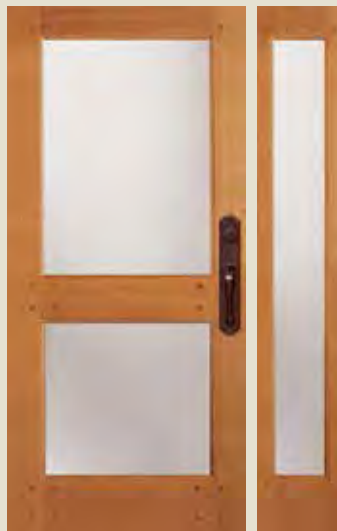
77082 Shown in Douglas fir with 77701 sidelight