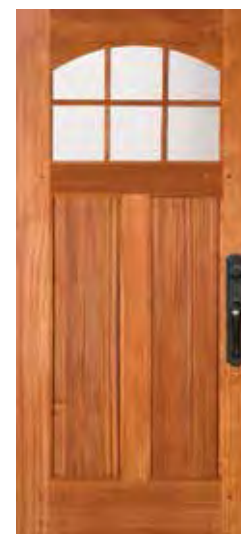
77660 FP Shown in sapele mahogany with optional shaker sticking