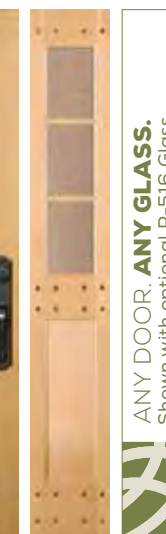
ANY DOOR. ANY GLASS. Shown with optional P-516 Glass.

RP 1-7/16" INNERBOND® DOUBLE HIP-RAISED PANEL FP 3/4" FLAT PANEL