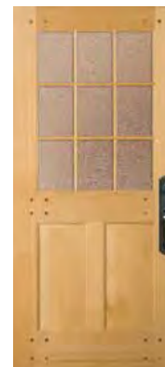
77944 FP Shown in nootka cypress with 77703 sidelight and optional P-516 glass. Privacy Rating 5.