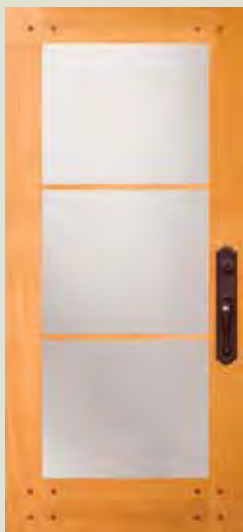
77103 Shown in Douglas fir with optional shaker sticking