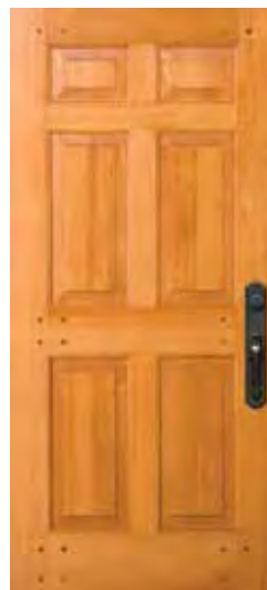
77130 RP Shown in Douglas fir