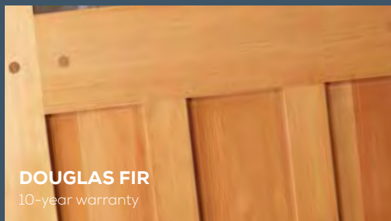
DOUGLAS FIR 10-year warranty