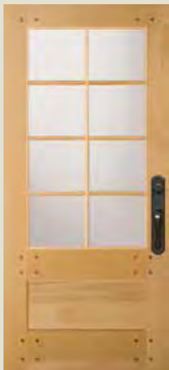
77508 FP Shown in nootka cypress