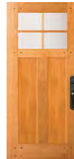
77664 FP Shown in Douglas fir with optional shaker sticking