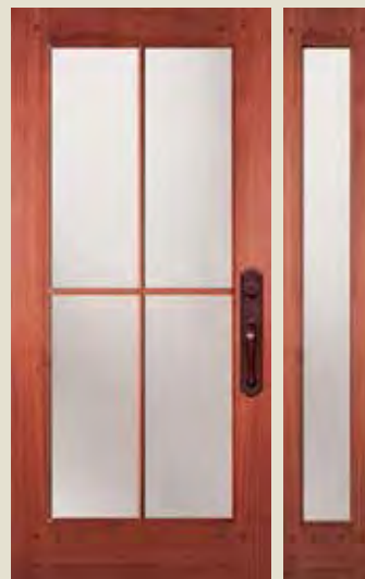
77122 Shown in sapele mahogany with 77701 sidelight