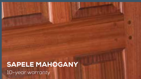
SAPELE MAHOGANY 10-year warranty