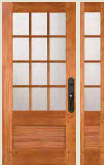
77512 FP Shown in sapele mahogany with 77804 sidelight and optional shaker sticking