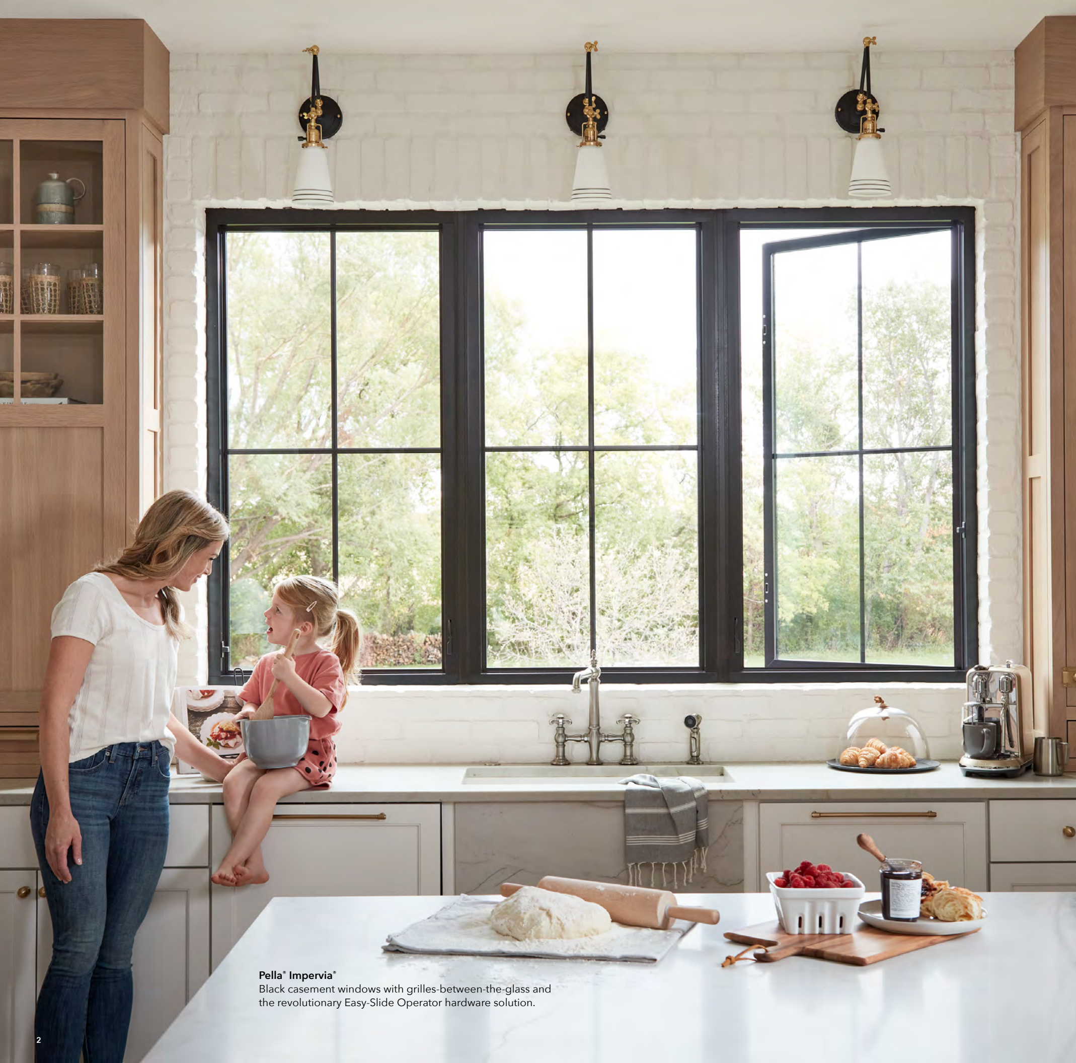
Pella® Impervia® Black casement windows with grilles-between-the-glass and the revolutionary Easy-Slide Operator hardware solution.