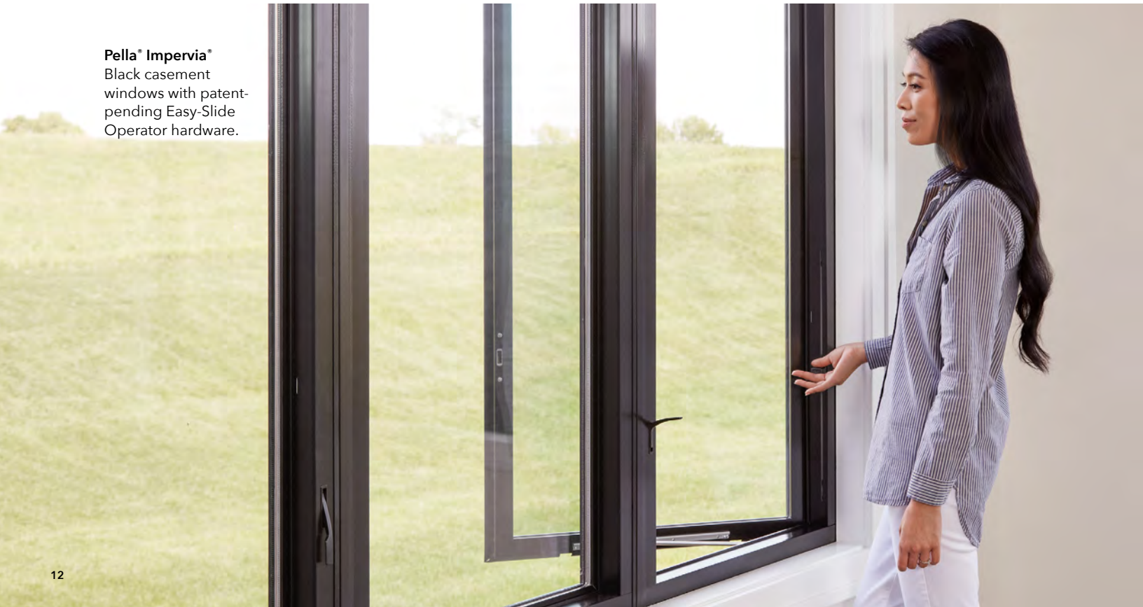
Pella® Impervia® Black casement windows with patent- pending Easy-Slide Operator hardware.